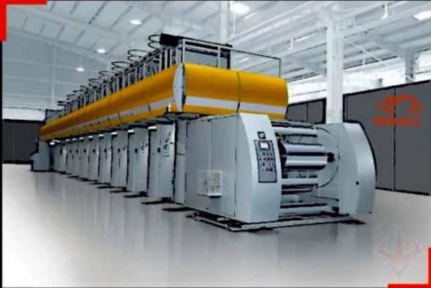
8 COLOUR ROTOGRAVURE PRINTING MACHINE WITH AUTO CONTROL SYSTEM