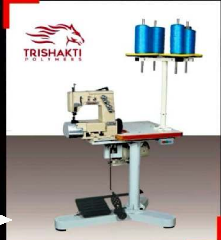
PP/PE BAGS SEWING MACHINE