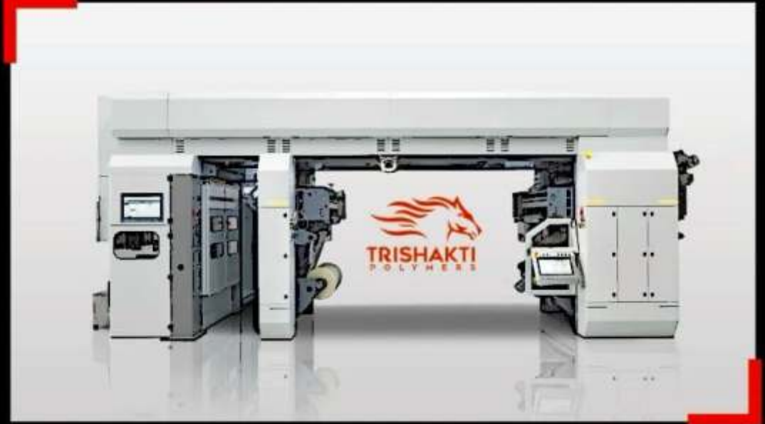
COMBI LAMINATION MACHINE SOLVENT LESS AND SOLVENT BASE