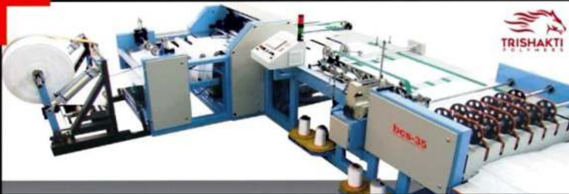
PP/PE BAGS CUTTING MACHINE