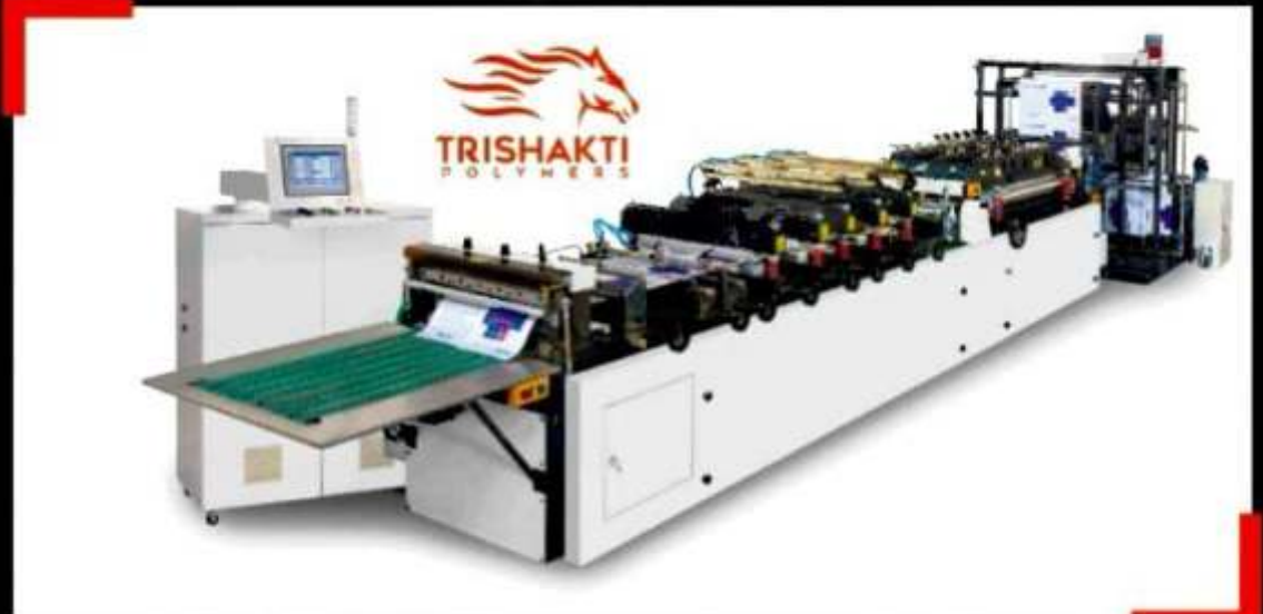
POUCHING MACHINE FOR ALL NEEDS