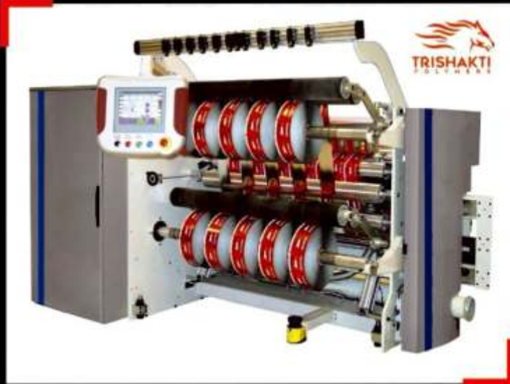
HIGH SPEED CANTILEVER SLITTING MACHINE